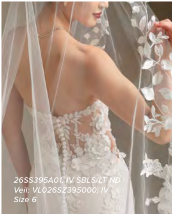
26SS395A01, IV SBLS/LT ND Veil: VL026SZ395000, IV Size 6