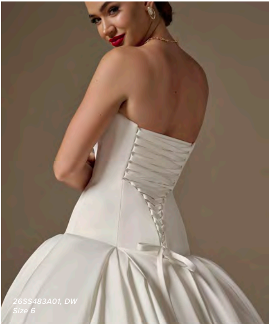
26SS483A01, DW Size 6