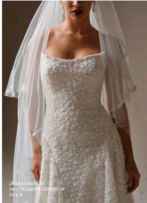
26SK433A01, IV Veil: VL026SB433000, IV Size 6