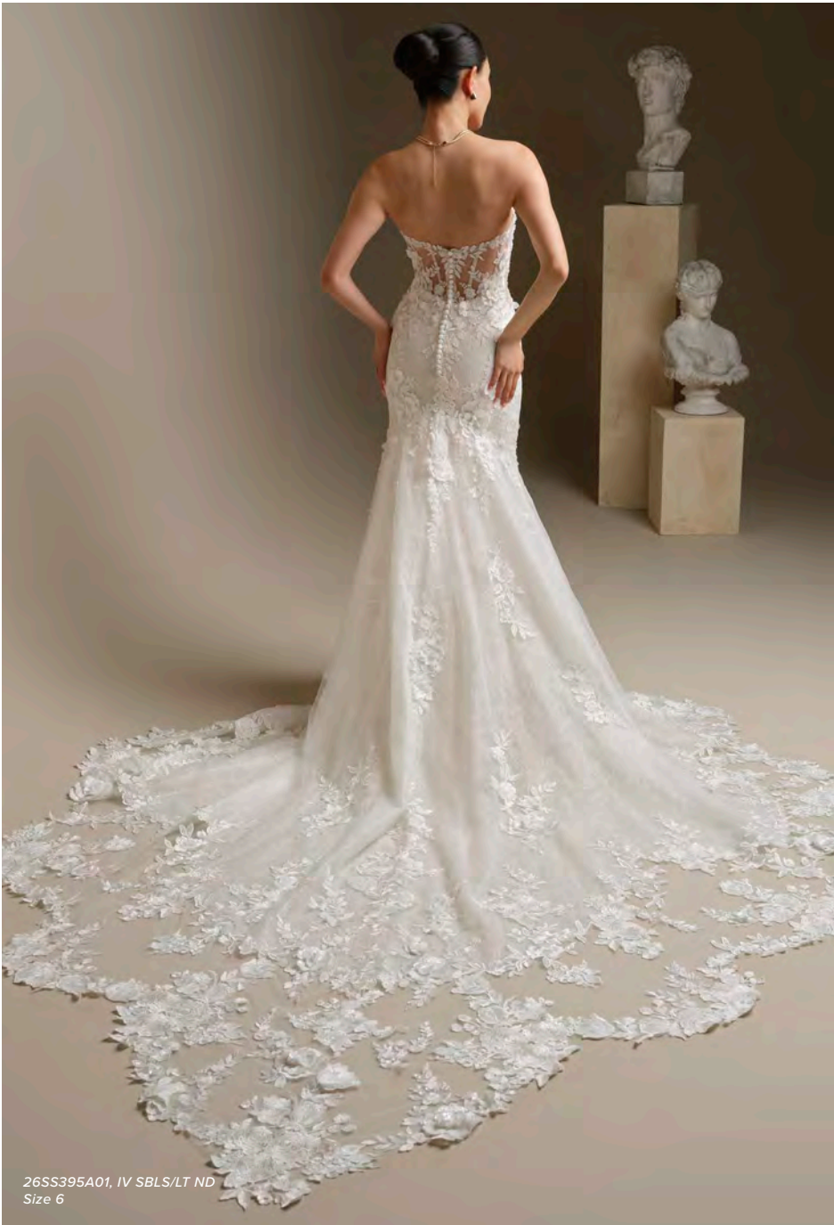
26SS395A01, IV SBLS/LT ND Size 6