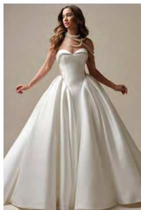
ABERDEEN VIDA* 25SW349A02