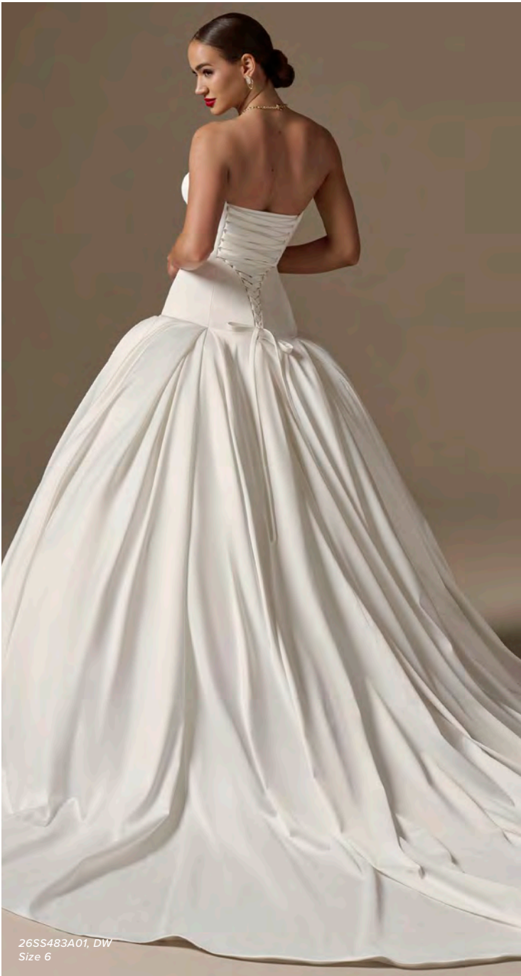
26SS483A01, DW Size 6