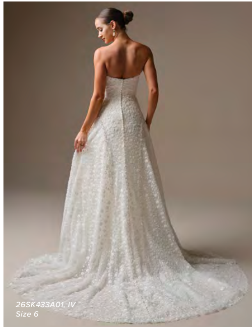
26SK433A01, IV Size 6