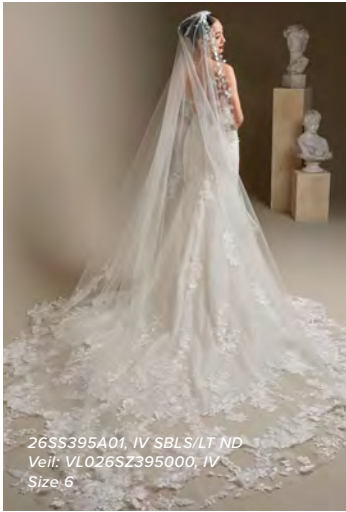
26SS395A01, IV SBLS/LT ND Veil: VL026SZ395000, IV Size 6