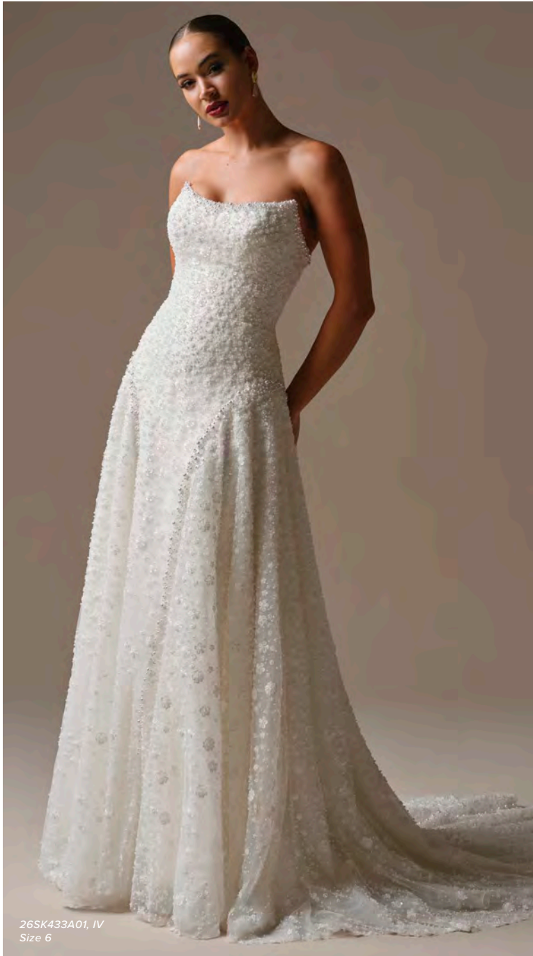
26SK433A01, IV Size 6