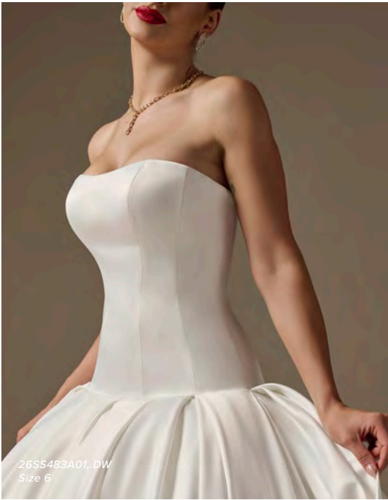
26SS483A01, DW Size 6