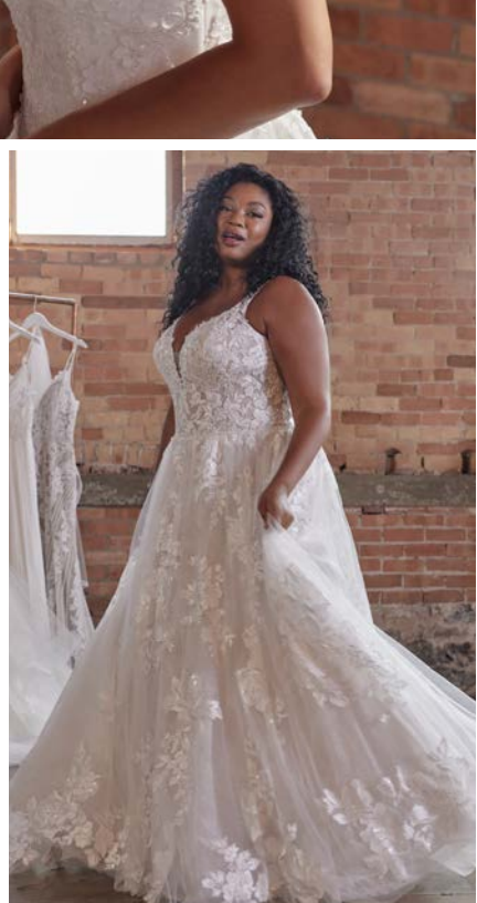
SOTTERO AND MIDGLEY Foll 2021